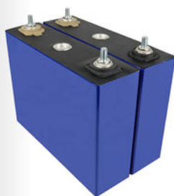
Lifepo4 battery 3.2V 304A