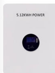
Solar LiFePO4 B5.12KW 51.2V 100Ah 200Ah atttery