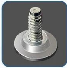
Positive/ Negative Electrode