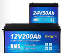
12V & 24V SERIES ENERGY STORAGE LITHIUM BATTERY