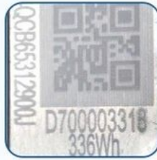
Complete QR Code