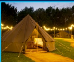
Household energy storage