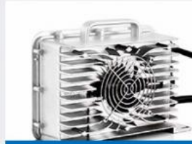
Lithium battery charger, waterproof IP65