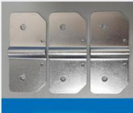
Low resistance connecting piece