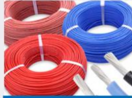
Pure copper flame retardant wire