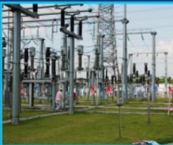
Power Station energy storage