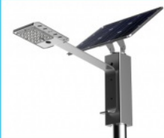
Solar Street Lighth