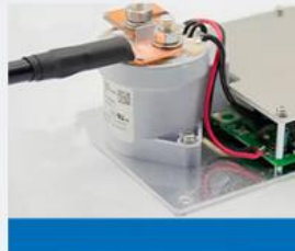
High Precision BMS