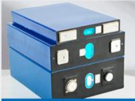
Automotive Grade Cells