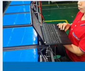
Professional debugging software